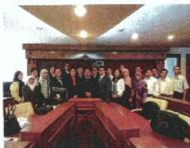
Delegates from each Branch