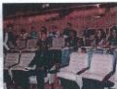
Area D3 discussion