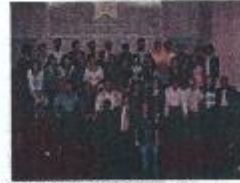
See you in 6 months!