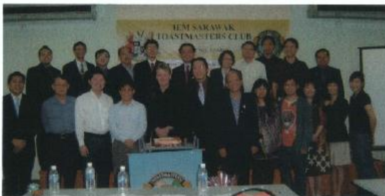
Club Anniversary, Installation and Appreciation Night

By 31 st December 2009, the Club Executive Committee (Exco) has held 6 Exco meeting to discuss about club matters. The Exco so far has not missed a single meeting.