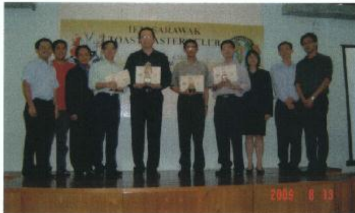
Winners for the Club Humorous and Evaluation contest

13 TH August 2009: Club Humorous and Evaluation contest