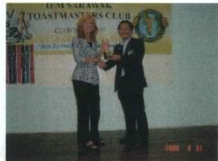
Winners for the Area Humorous and Evaluation contest

24 th September 2009: Hari Raya Night where we open fast and serve dinner for our Muslim members on Puasa month.