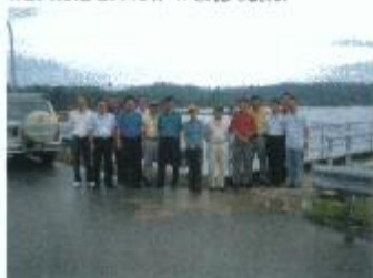
Picture Left: Technical Visit to Bintulu Petronas LPG Bottling Plant

One-Day Seminar entitled "New JKR Sarawak Form of Contract and Related Procedures" was held at New World suite.